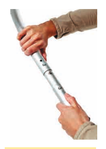
Display Stand frames utilise a simple 'click together' mechanism.

These display stands give you a superior presence at exhibitions and are ideal for permanent indoor office or studio props.